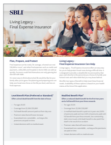
Final Expense Insurance Consumer Brochure