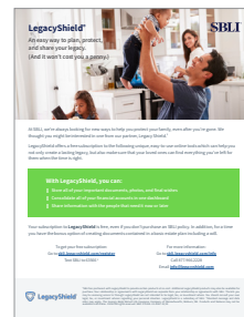
The LegacyShield ® Consumer Brochure