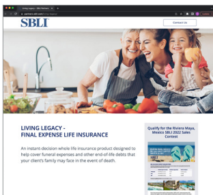
Sales & Marketing Resources Microsite