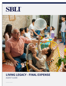
Final Expense Insurance Agent Guide